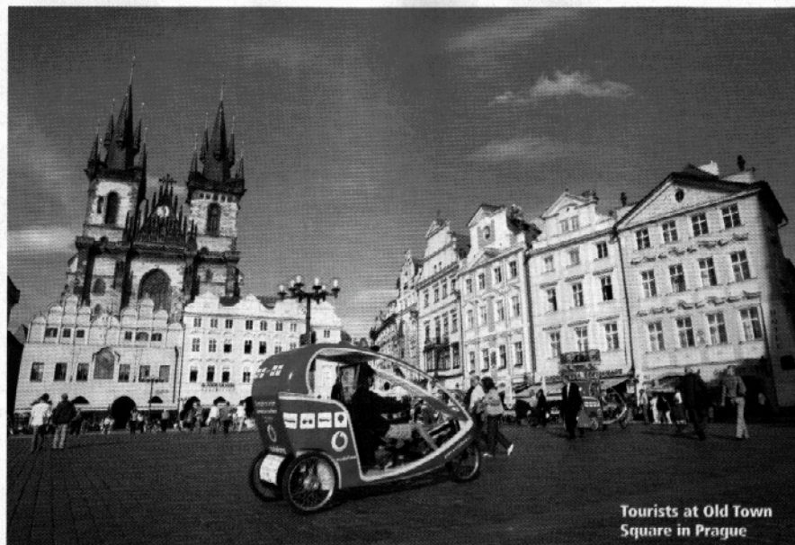
Tourists at Old Town Square in Prague

The Festival of Bollywood in Prague (October 12-18, 2009), now in its third year, is a popular local event. This year there is a follow up Festival Echoes screening in Brno (another Czech town) on November 26, 2009. Besides screening new hits, the festival will also showcase classics like Zanjeer and Guru Dutt's Aar Paar . The event is action-packed and whips up a local craze for bindis and samosas. There are also Bollywood dance competitions